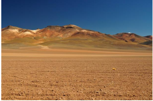
Fig. 1-3. Different natural landscapes: most people would chose the 3^{rd} (savannah) as most desirable as the deep forest is associated with dangerous predators (too much detail, no larger scale overview) whereas the desert boasts too little life (too little detail up close, barren)