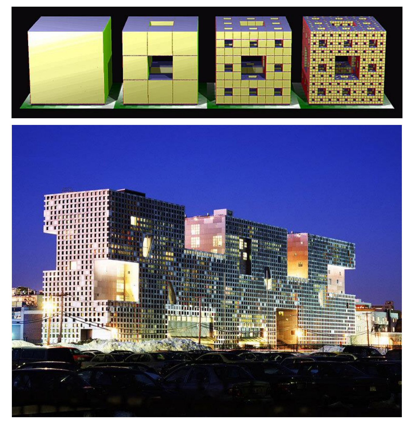
Fig. 7 The Menger sponge exemplifies an infinitely complex figure from a very simple shape (a cube) and a very simple function (removing the centre squares of all six faces of the cube)

An application of this geometrical figure was Steven Holl's Simmons Hall (2002), where we can see increasingly smaller square windows on the facade (fig. 8).